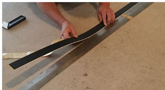
After exact measurement, carefully remove the covering paper from the reverse side of the strip.