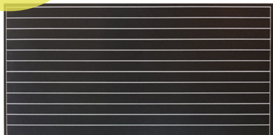
The guide strip is mounted on a large sheet of 12 profiles.

* Non-stock item, allow 2-3 weeks for delivery.